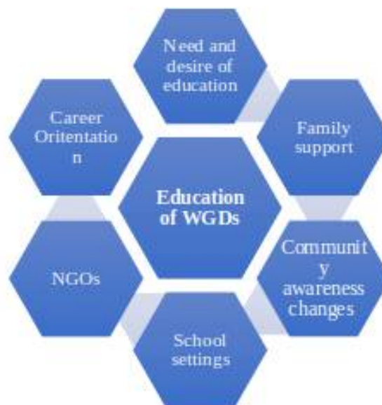
Figure 2. Factors affected opportunities for higher education and vocational training.

The results of the case study analysis showed that there were several prospects for WGDs to pursue their higher education and vocational training. Though the three case studies were suffering from discrimination and stigma in various ways with different levels, there were some opportunities for them to engage in schooling and career guidance as follows: